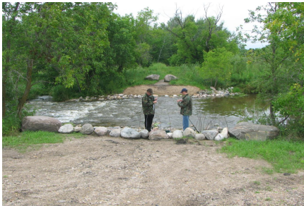
Seine River Flow Project - After